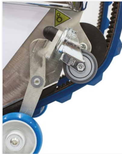
■ Additional wheels

Positioned at the back, they make manoeuvres on landing easier