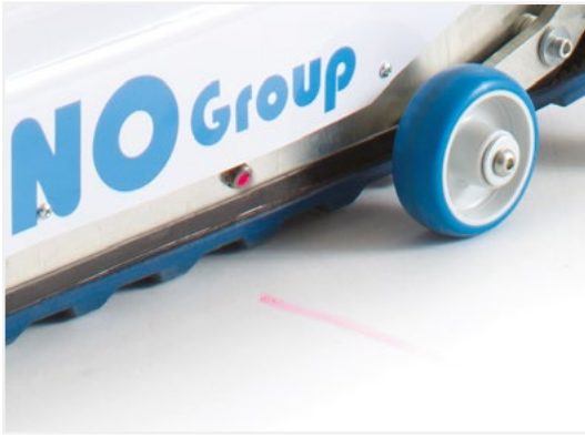
■ LED for balance point